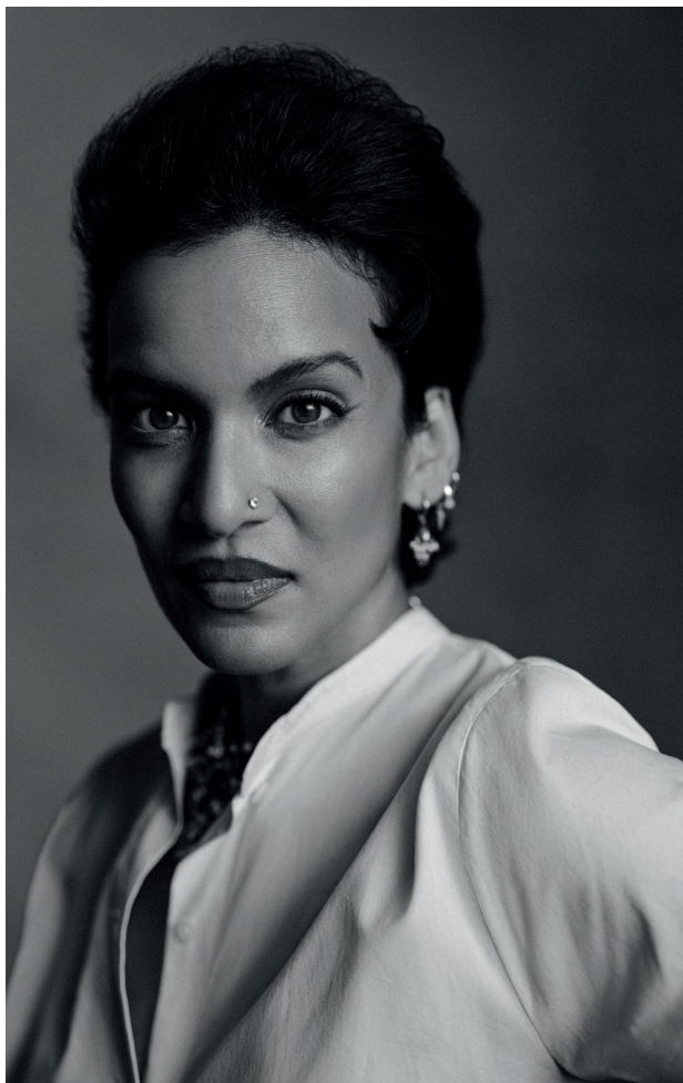
Anoushka Shankar.